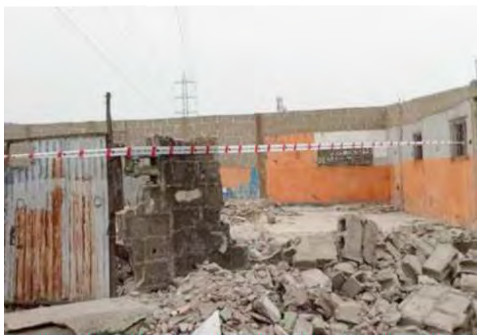
The demolished structure

He also called on Lagosians to report any building irregularity noticed in their localities to the Agency for prompt and necessary action.