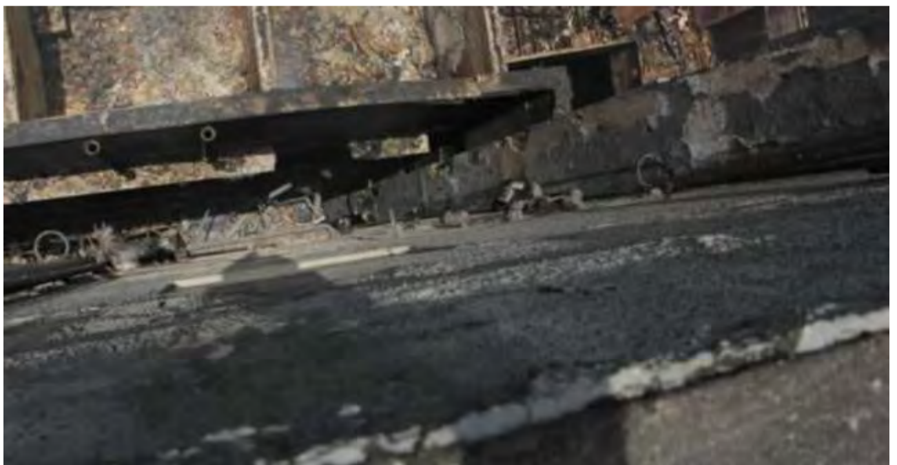
The Burnt Balogun Building

T he Lagos State Government, through the State Materials Testing Laboratory, has concluded plans to conduct a structural and stability test on buildings affected by