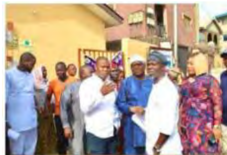
PHC tour in Ojodu LCDA

its promise to call for more manpower, equipment supplies from the state government.