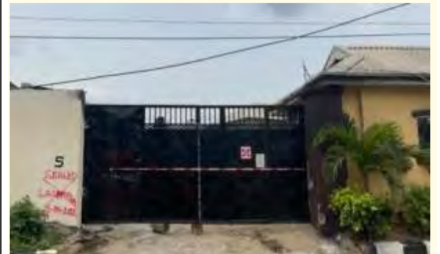
Sealed company in Ajao Estate