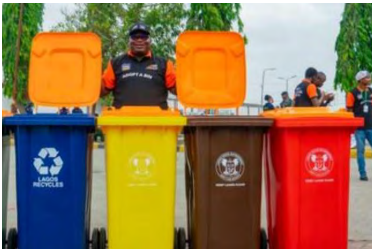
Lagos Recycling bins