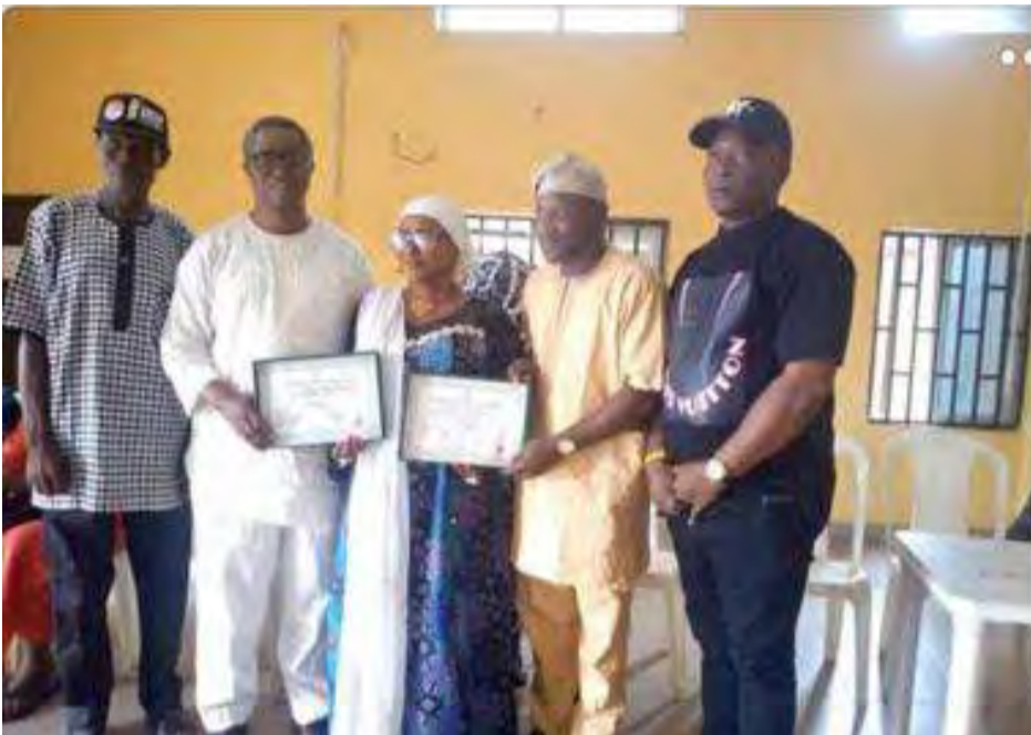
Apapa Iganmu Federal, state elect representatives with LCDA chairman