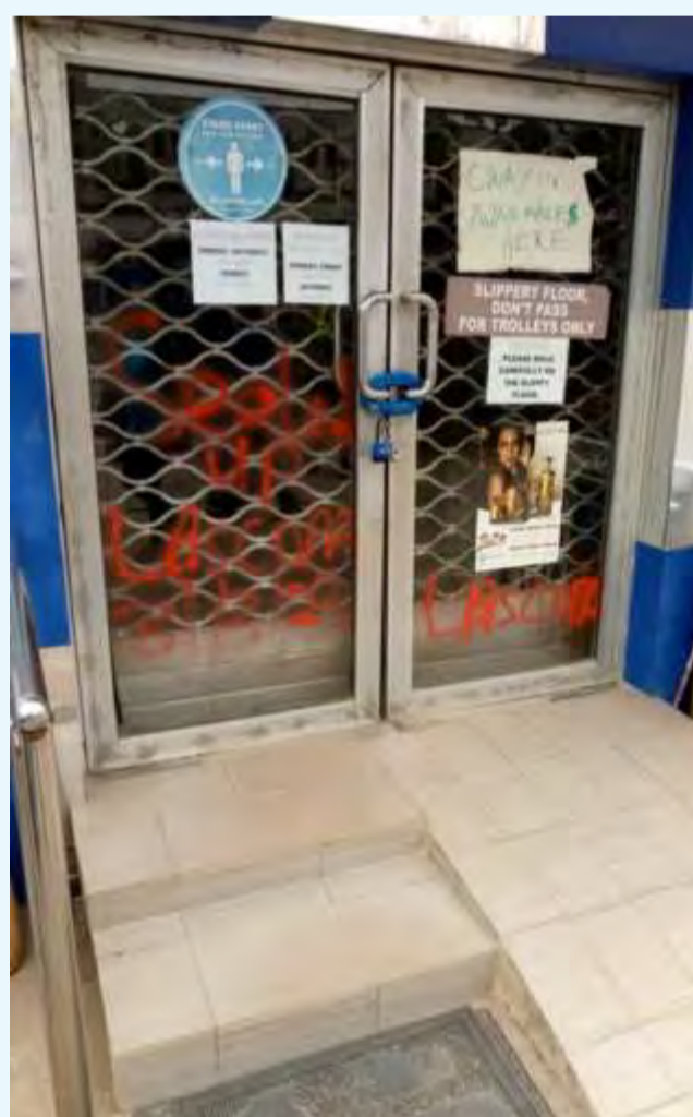
One of the sealed supermarkets

State by visiting the Agency's Head office located at 2b, Soji Adepegba Close, Off Allen Avenue, Ikeja, or any of its Annex offices at Badagry Local Government Secretariat, Bariga LCDA Secretariat, Ikoyi-Obalende LCDA Secretariat and Ikorodu Local Government Secretariat. He also implored concerned members of the public to call 08092509777, 08124993895, 09064323154 or send Emails to lascopa@lagosstate.gov.ng or lascopa@gmail.com to report any individual or company that infringes on their rights.