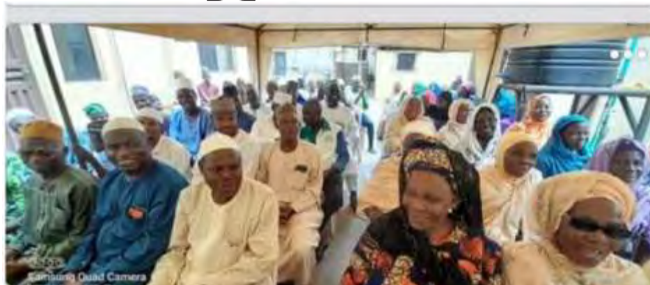
Ifako-ijaiye Ramadan lecture on kindness

The Ramadan lecture is an annual routine put together by the Muslim