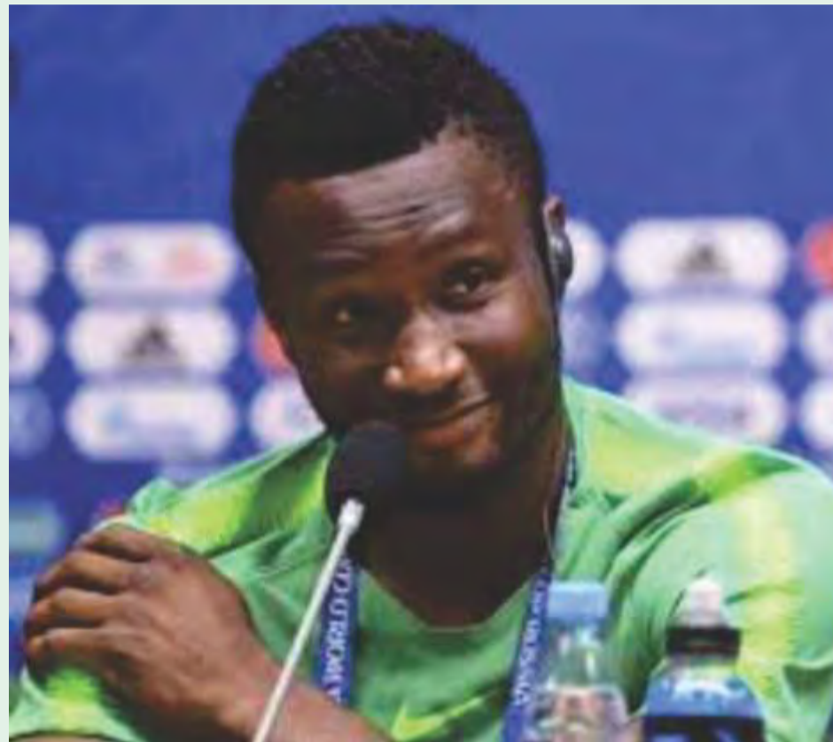
John Obi Mikel

He was part of the Nigeria side that won the silver medal at the FIFA U20 world cup in 2005 after losing the final to Argentina.