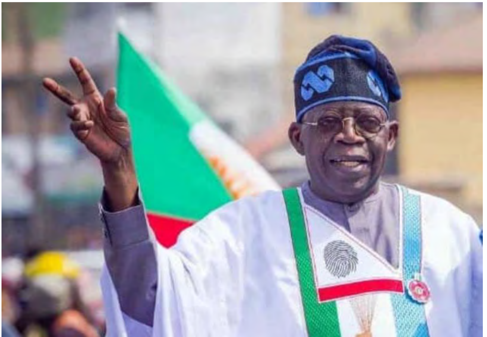
Asiwaju Bola Ahmed Tinubu

At a recent press conference, the SGF said the committee will break into three sub-groups: inauguration, transition