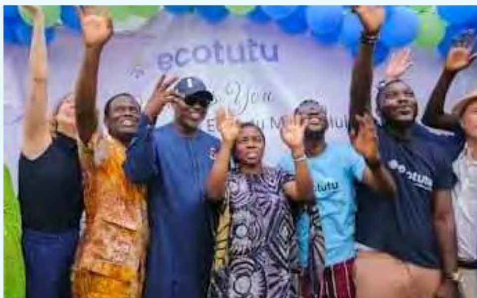
Diaspora APC group

"This is why as a group, we have decided to launch the Food Bank in furtherance of our firm trust that the incoming administration of the