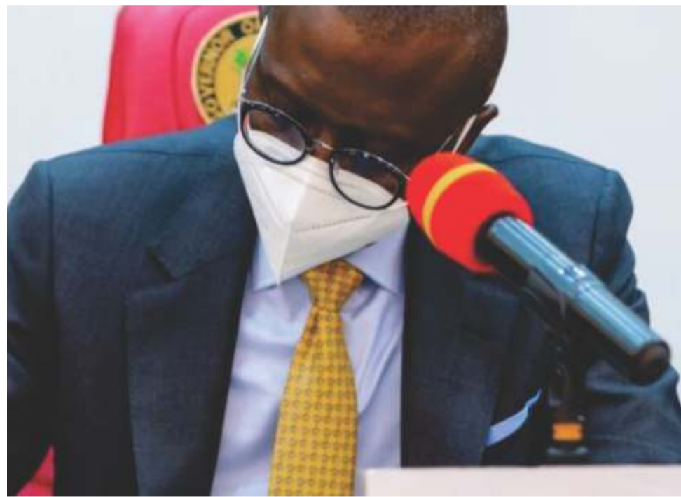
Mr. Babajide Sanwo-Olu