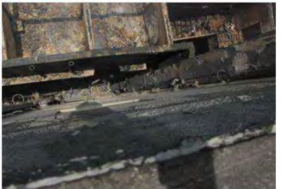
Parts of burnt Balogun market building

The Lagos State Government, through the State Materials Testing Laboratory, has concluded plans to conduct a structural and stability test on buildings affected by the recent fire incident at Balogun Street on