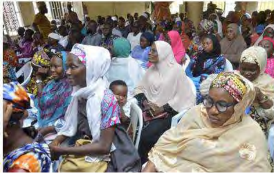
Islamic faithfuls listening to the Ramadan lecture held in Mushin