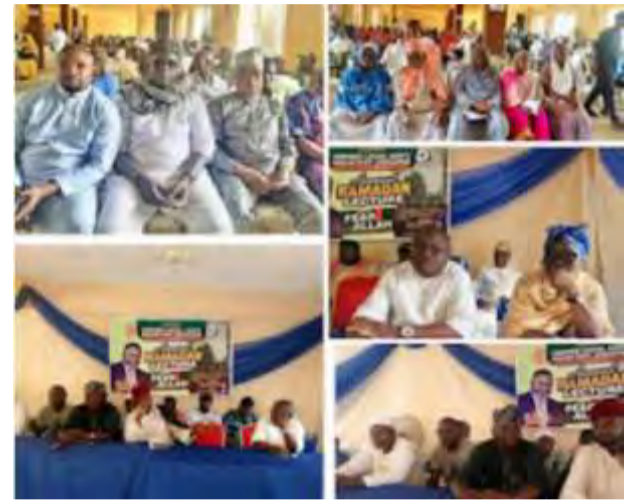
Oshodi-isolo Ramadan lecture

cautious of Allah in whatever they do, saying only the fear of Allah can bring everlasting succor to mankind. He stated that leaders and followers must rule and follow in accordance to the dictates of Allah. Hence, he charged leaders to have piety as a prerequisite for leadership.