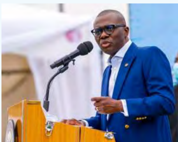
Gov Babajide Sanwo-Olu

visual, fire ratings analysis and Non-Destructive Test (NDT), adding that on completion, the report will be made available to the appropriate authority for further action.